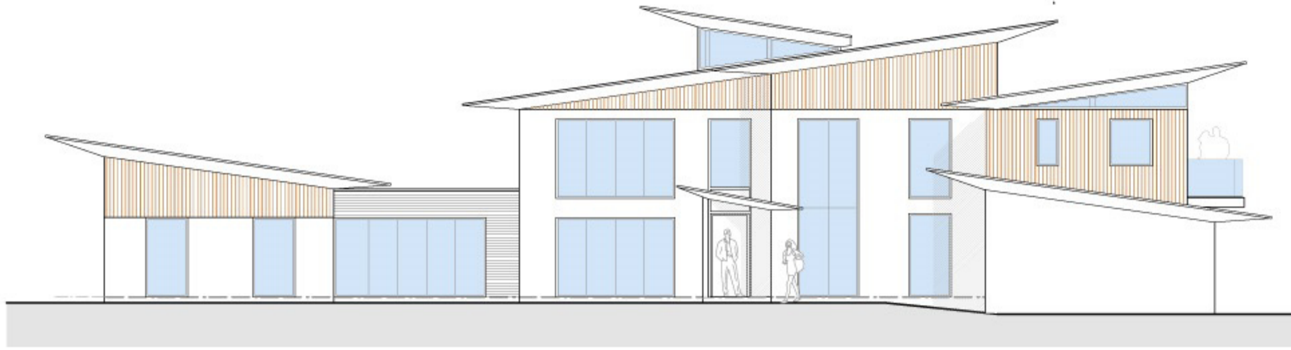
PROPOSED NORTH WEST (FRONT) ELEVATION